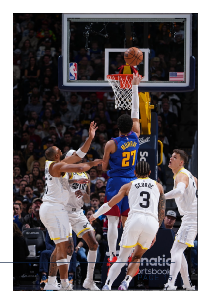
16 steals from second most in franchise history