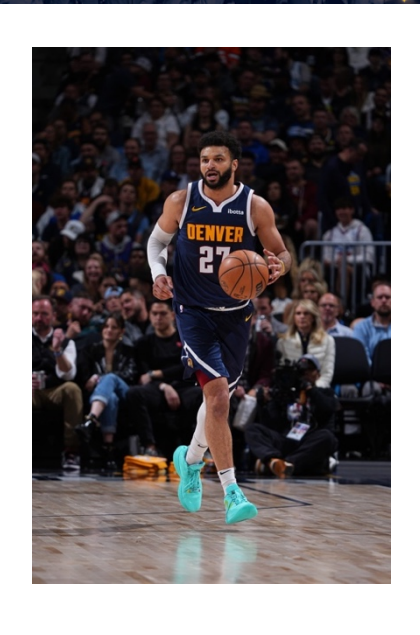
Two games from third most in franchise history