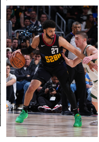
Seven rebounds from eighth most in franchise history