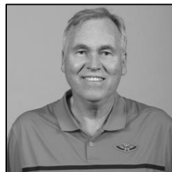
Mike D'Antoni Coaching Advisor