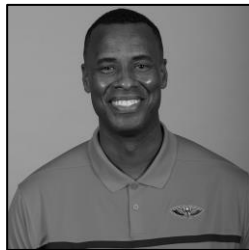
Jarron Collins Assistant Coach